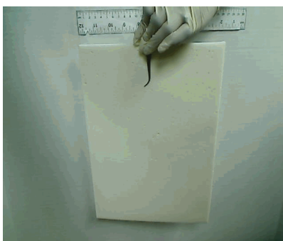
View of content