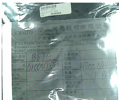
Package received - labeling COC

Laboratory Number Beta-526589 Percent modern carbon (pMC) 37.78 +/- 0.14 pMC Atmospheric adjustment factor (REF) 100.0; = pMC/1.000