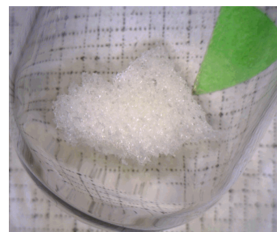
14.9mg analyzed (1mm x 1mm scale)

Disclosures: All work was done at Beta Analytic in its own chemistry lab and AMSs. No subcontractors were used. Beta's chemistry laboratory and AMS do not react or measure artificial C 14 used in biomedical and environmental AMS studies. Beta is a C14 tracer-free facility. Validating quality assurance is verified with a Quality Assurance report posted separately to the web library containing the PDF downloadable copy of this report.